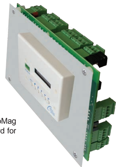
Photo shows cover in place on a simulated door.